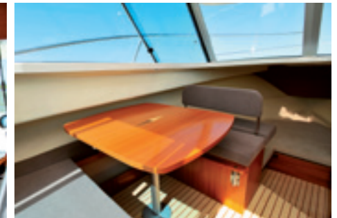
FINISH: A wooden table complements the wooden fitted interior and lends an air of tradition.