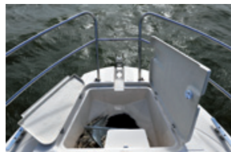
Cavernous chain locker with gull wing hatch covers.

As a multi-purpose craft, the Timonier 725 has most bases covered – comfortable cruising, spacious cockpit and practical seakeeping. Exactly the sort of boat many people are looking for. PBR