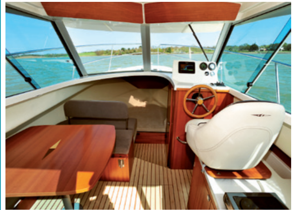
CABIN: The wheelhouse and cabin are all one with a flat deck throughout that permits through vision all round.