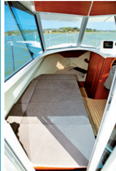
MAIN BERTH: Created out of the dining table and seating