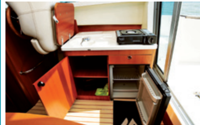
GALLEY: The galley unit has storage and fridge all in the same unit.