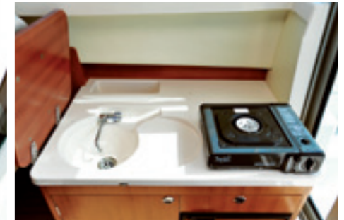
GALLEY: well ventilated, right next to the cockpit doors.