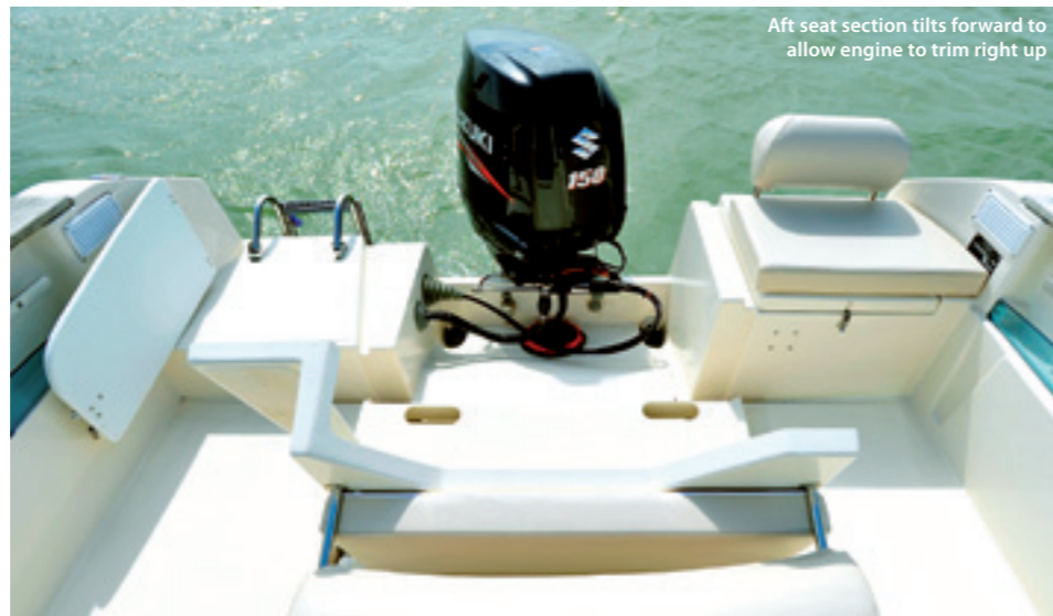
Aft seat section tilts forward to allow engine to trim right up

OCQUETEAU IS A family-owned boatbuilding yard based not far from La Rochelle, amid the shrimp and oyster growers of the Ile d'Oléron, which was once an island of revolutionaries who stood up against the King of France and has a seafaring tradition that can be traced back to earliest times. The first rules of the sea were drawn up on the Ile d'Oléron, and were called the Rolls of Oléron. These rules were adopted by navies throughout Europe and they formed the basis for the modern Rules for the Prevention of Collisions at Sea. The company has a long-standing reputation for building boats for fishermen, and more latterly for pleasure boaters.